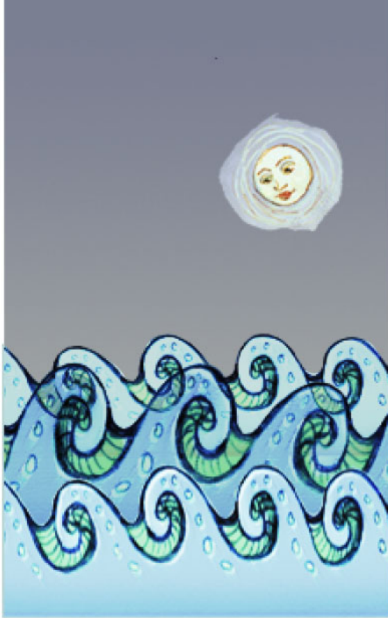
A) This piece is the backdrop