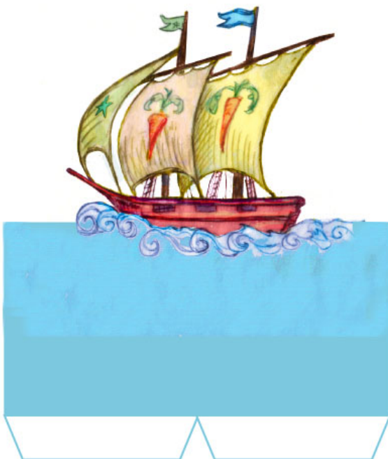
B) This piece goes in front of the backdrop

Here is a layout of the floor of the puppet theater. It shows where to glue the boat and waves.